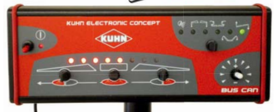
BUS CAN DPS box